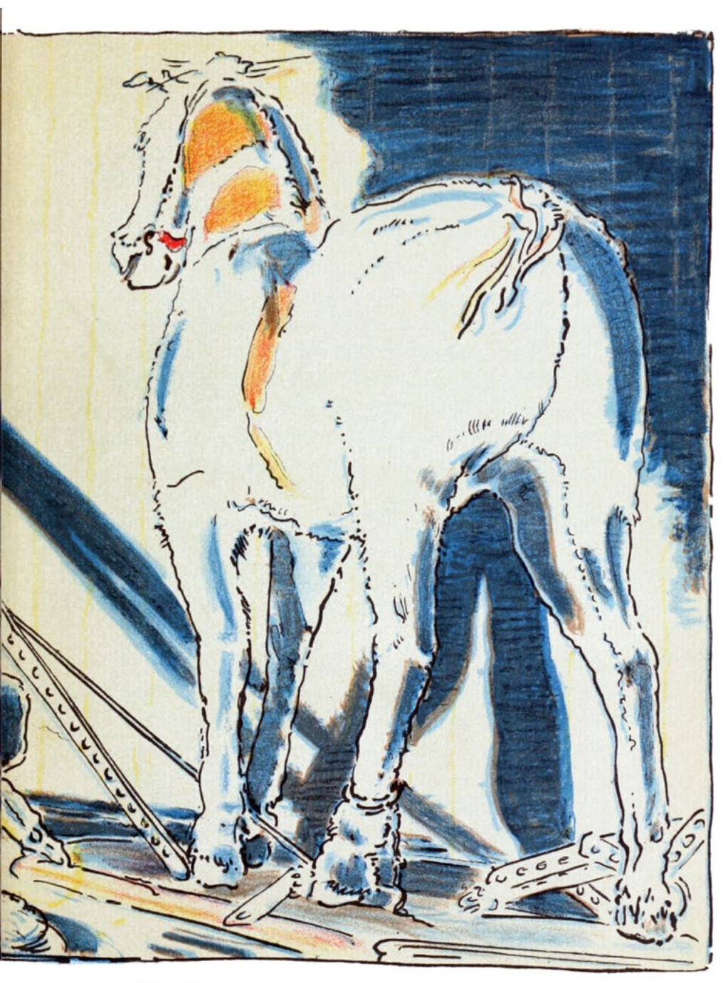
tells his story